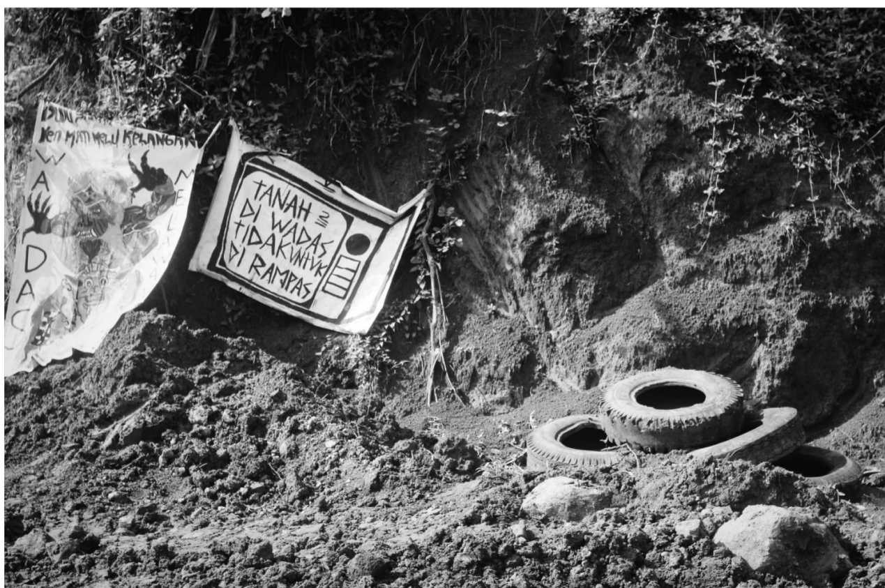
Mural banners rejecting andesite mining appear near the construction of an access road connecting the mining site in Wadas and the Bener Reservoir location in Bener Village, which is around 12 km away.

Instead of canceling the mining plan, Dhanil actually saw the government using repressive methods ( https://projectmultatuli.org/cara-polisi-melakukan-kekerasan-ke-warga-wadas-penolak-tambang-andesit-saat-mengepung-desa-wadas-februari-2022/ ) against residents who refused mining. Despite the repression, some residents to this day still firmly reject the existence of andesite mining in Wadas.