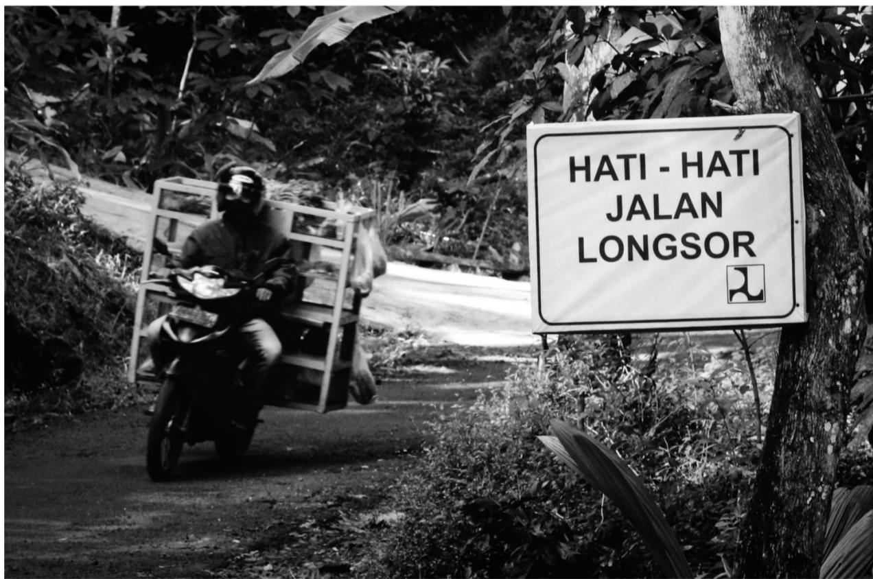
A vegetable seller passes by on his motorbike near a sign warning of the danger of landslides. Similar warning boards are installed at a number of points along the road in Wadas Village, Purworejo, Central Java.