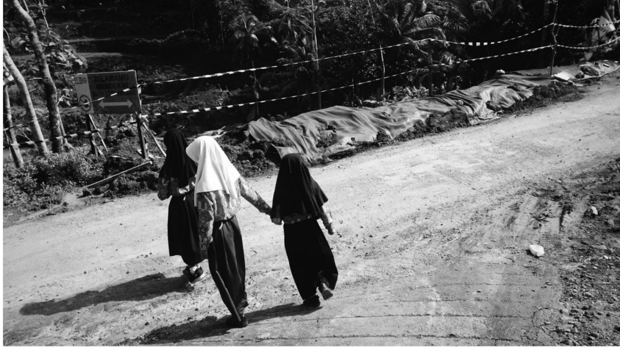
Three school children walk near the edge of a cliff covered with plastic tarpaulin which functions to reduce the impact of landslides caused by the construction of an access road to the mining area in Wadas Village, Purworejo, Central Java, (Project M/Dhoni Setiawan)