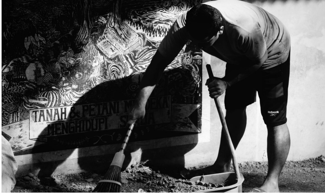
A man cleans dry mud left over from flooding caused by land clearing for the construction of an access road to a mining area in Wadas Village, Purworejo, Central Java.